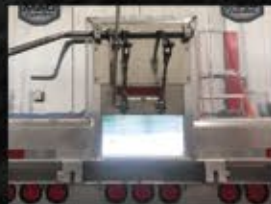
Replaceable Coal Door