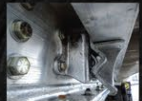
Spring Loaded Body Hold Down