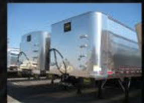
Radius Front Bulkhead