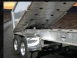
Aluminum Panel Floor