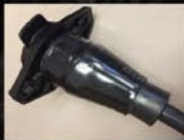
Sealed 7-Way Harness