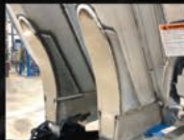
Front Doghouse Cap-offs