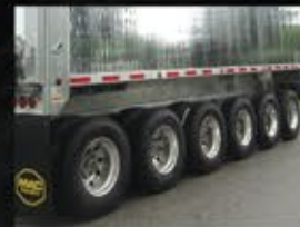
Multiple Axle Configurations