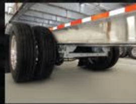
AANL-230 w/ 250 air bags & Hendrickson HXL-5 sealed Wheel End Sys. (5-yr. Warranty) Galv. suspension hangers & brace.