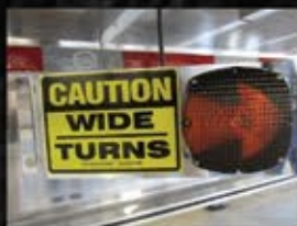
Wide Turn directional arrow on each side