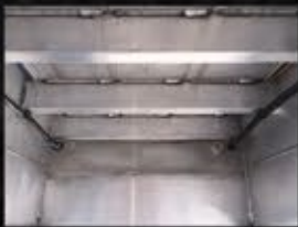
MAC's Integrally Superior Welded Design