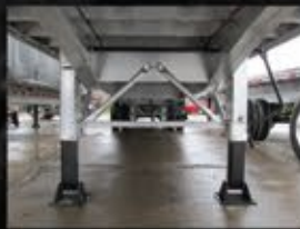
Flatbed Landing Gear K-bracing