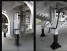
JOST AX150 Aluminum Outer Leg Landing Gear