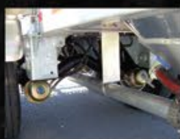
Raised Center Axles