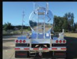
102" Wide Low Center of Gravity