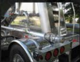
Rear Air Inlet

(L) - Specific to Low Cube Tanks (H) - Specific to High Cube Tanks