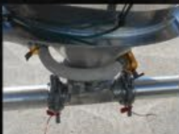
Easily Removable Cam-on Couplings