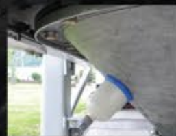
Bolt on Lower Cones