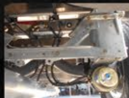
Galvanized Suspension Hangers and Soft Coat Axles