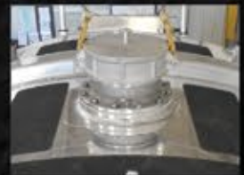
Optional Washout Nipple