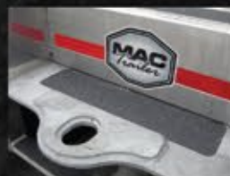
Galvanized Tow Hook