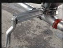
Valve Handle Extensions