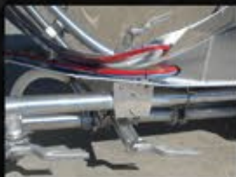
Wiring & Airline Accessibility