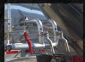
Valve Handle Extensions