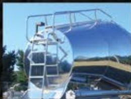
Transition Walkway with Handrails