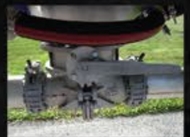
Bottom Drop Tees