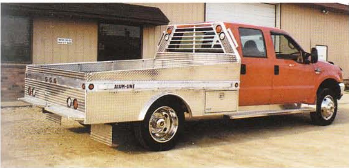
12. The above unit has 16" deep side skirting added to the platform. This will hide the frame and enclose the rear hitch area. Also note, the built-in tool box, sides, and step bumper. Skirting available on all models.