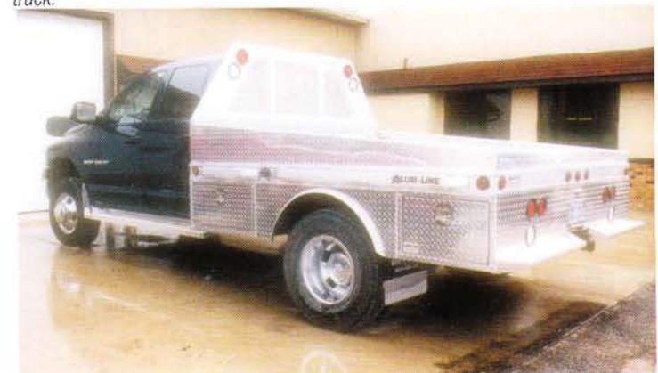
9. Give your bed a personal touch. Extra boxes, rub rail, wheel flairs, plus more. All types of lengths and widths available.