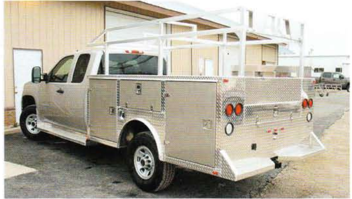
19. One of our most popular set ups. Compartment height at 40" with overhead ladder rack and step bumper. Other popular options include 4" deep flip top compartments on top, adjustable shelving, slide out trays, painted doors and much more. All models available in smooth or treadbrite aluminum construction.