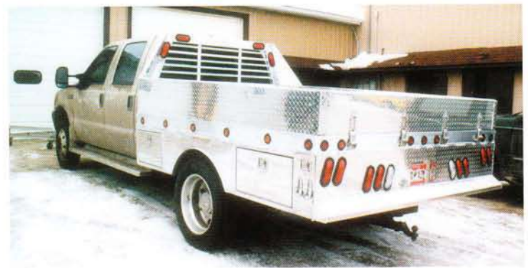
8. Another choice of sides can be matched to almost any inch increment you desire. All hitches used with ALUM-LINE beds are attached to the frame of the truck.