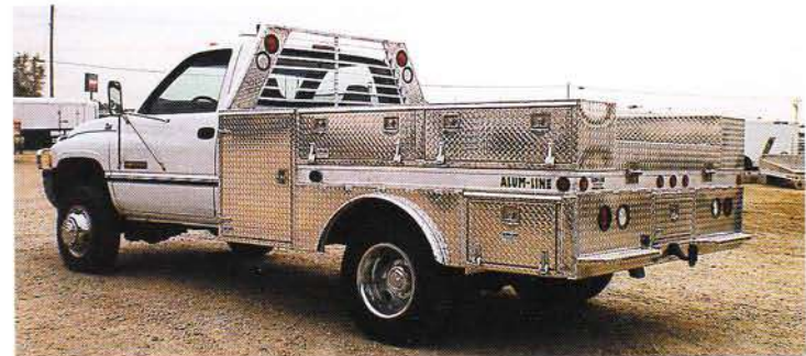
3. Component body. With our special front corner cutouts, you can have tall upright boxes yet the strength of a platform body. Extra storage includes removable top boxes and small boxes behind the wheels. A lower price alternative to a service body.