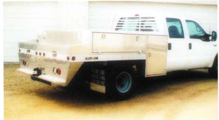
2. Equipped with optional above bed tool boxes, upright front tool boxes, rear step bumper, louvered bulkhead and short sides. You can build a body your way.