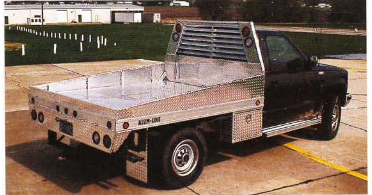
7. Our most popular truck bed package. Louvers and lights, tapered side boards, underbody tool boxes, mudflaps, and fifth wheel trap door.