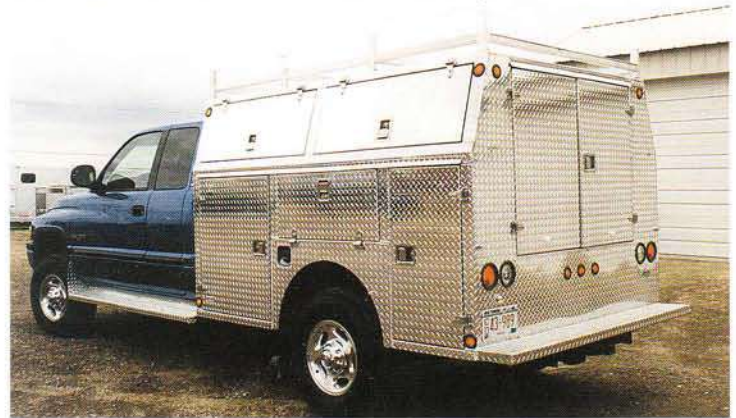
21. All types of customizing available including: shelving, transverse compartments, roll out trays, double pan doors, door stops, special latches, hanging hardware, and interior lighting. Our rescue bodies have been used and approved by the U.S. Army.