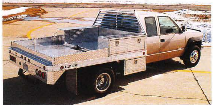
1. Truck bed with boxes on top and below. Finished with short sides and louvered bulkhead.