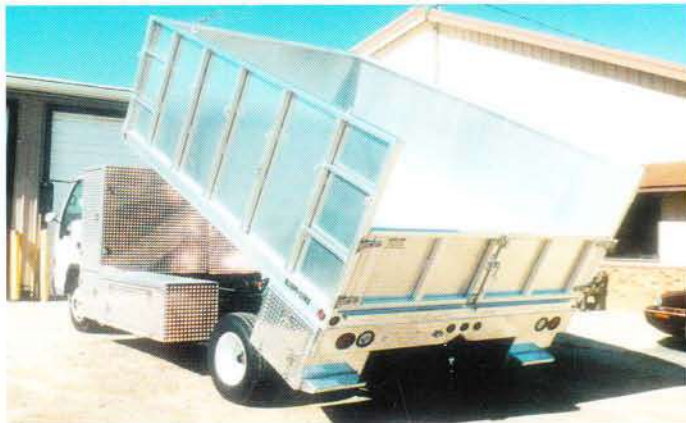
18. Special dump body set up using a "Back Pack" behind the cab. "Back Packs" provide extra storage for large tools, shovels, etc.. Please note the removable stake sides for multiple use.