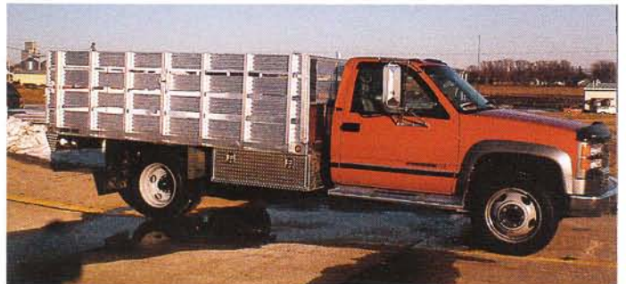
15. Truck bed with 36" high stake rails. Stake racks are available in any height or in solid sides. Sides are light weight and are easy to install or remove. Rear doors can be pull-out or swing-out design. Used with rub rail with stake pockets.