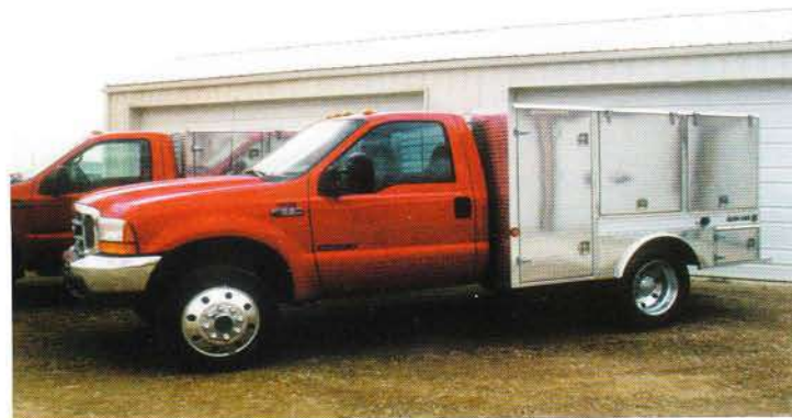
6. Special use service trucks can be designed to fit your needs. ALUM-LINE has designed a variety of bodies for rescue and brush fire service.