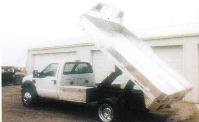
17. Bed capacities up-to 12 ton are available. Our extruded flooring offers easy dumping. Permanent solid sides come in a variety of heights and in either smooth, extruded, or diamond plate material.