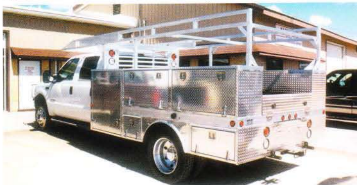
5. Overhead ladder racks can be made permanent or removable. Side boxes are available with double drop-down doors. Large front storage boxes.