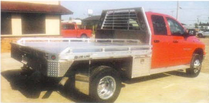
11. We will build any size bed to fit your dimensions. Light weight beds are an ideal alternative to pickup boxes and give you more universal uses. Pictured with tapered rear corners.