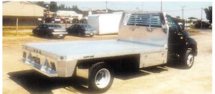
14. ALUM-LINE will build beds up-to 24' in-length and 20,000 lb capacities. Special strength features include: 1/2" thick outside rail, 3" I beam, 1/4" wall cross members on 12" centers, and 1 1/4" extruded flooring. Put our bed to the test... You will be very satisfied. All types of loading ramps available.