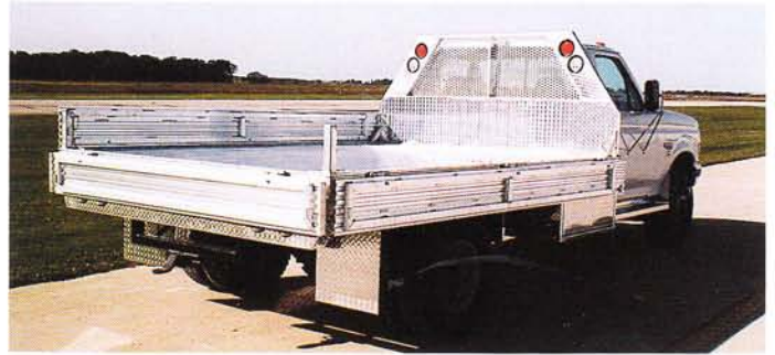
13. A 12' length standard platform with a mesh window protector. Please note the fold down sides. Available in various lengths. ALUM-LINE beds are easily converted to your next truck.