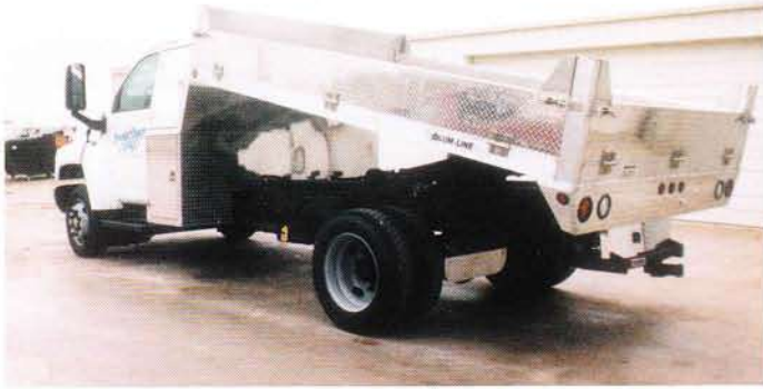
16. ALUM-LINE dump body platforms are heavy duty. Special strength options include; 1/2" thick outside framing with 1 1/4" extruded flooring. Channel long sills and heavy duty bulkheads complete the package.