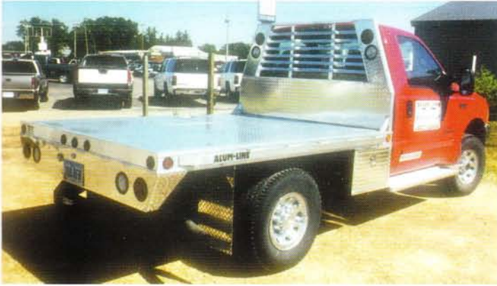
10. Standard package includes open window bulkhead, light package and stake pockets. Everything you need for a classy look. Popular options include louvers and lights, rub rail and under side boxes.