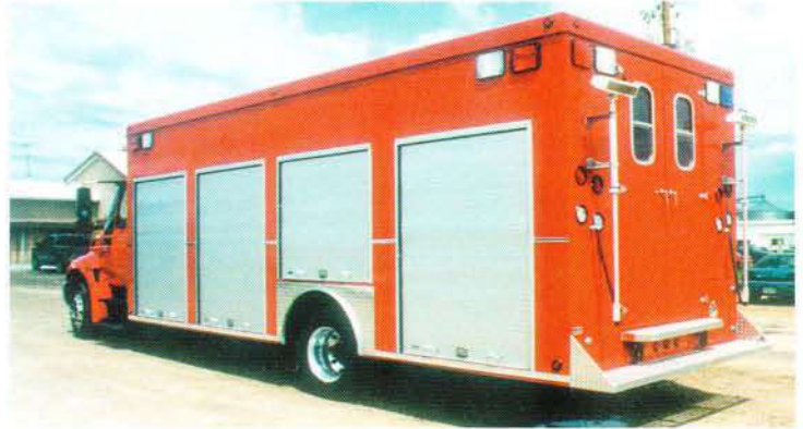
20. Rescue body with 60" box height. Four compartments per-side and finished in .125 smooth aluminum painted sides. Rear step bumper and rolled fender flares. More information is available on our complete line.