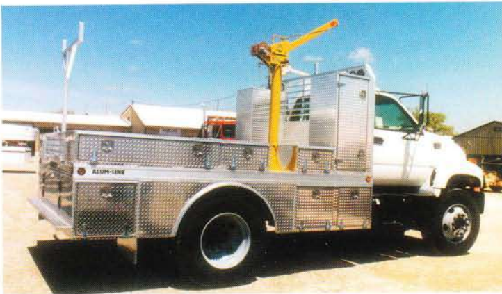
4. Beds can be designed with a frame cut-out to attach special use equipment. Side boxes can be built any height. Beds built tough enough for medium-duty trucks.