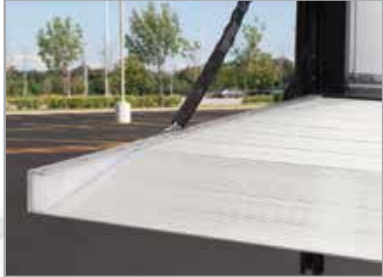
Aluminum Ramp Shown