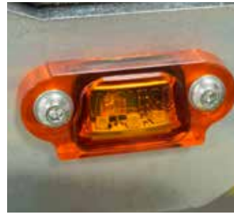
Platform warning lights.