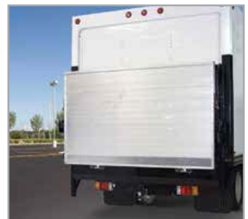
MDL Series Gate in stowed position