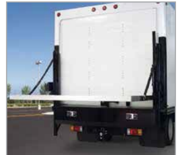
Above-Floor Option shown

Easier handling of wheeled carts, bins and racks with this level-ride platform liftgate.