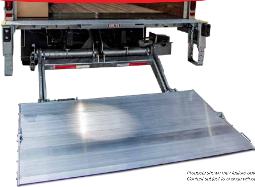
Products shown may feature optional equipment. Content subject to change without notice.

EASY TO OPERATE, EASY TO MAINTAIN, CONVENIENT TO STORE.