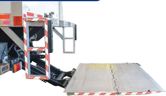
MODEL REP33 EA 48