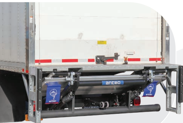
MODEL REP44 EA 62